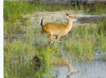
White tailed deer in Hungryland Slough Natural Area