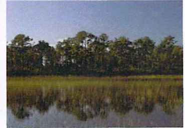
Loxahatchee Slough Natural Area