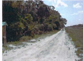
Existing management road will be improved along the C-18W Canal